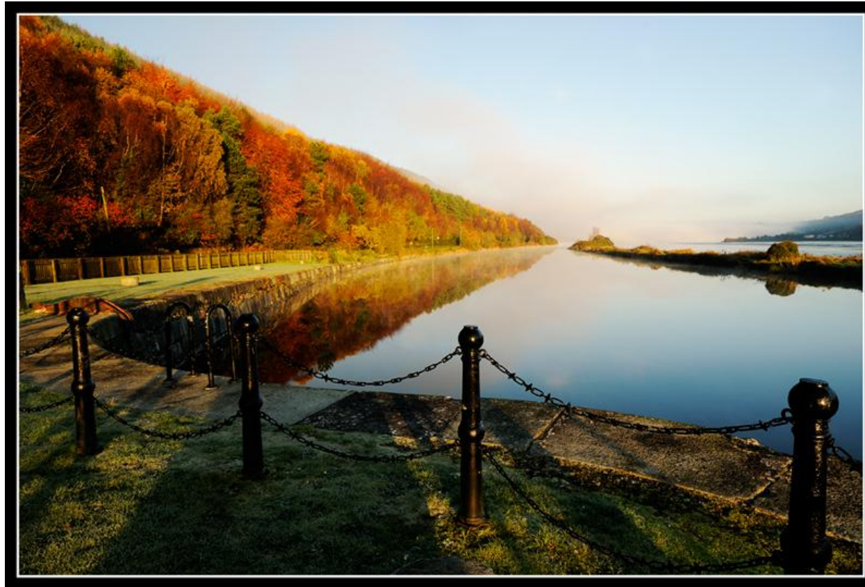
Newry Canal in autumn